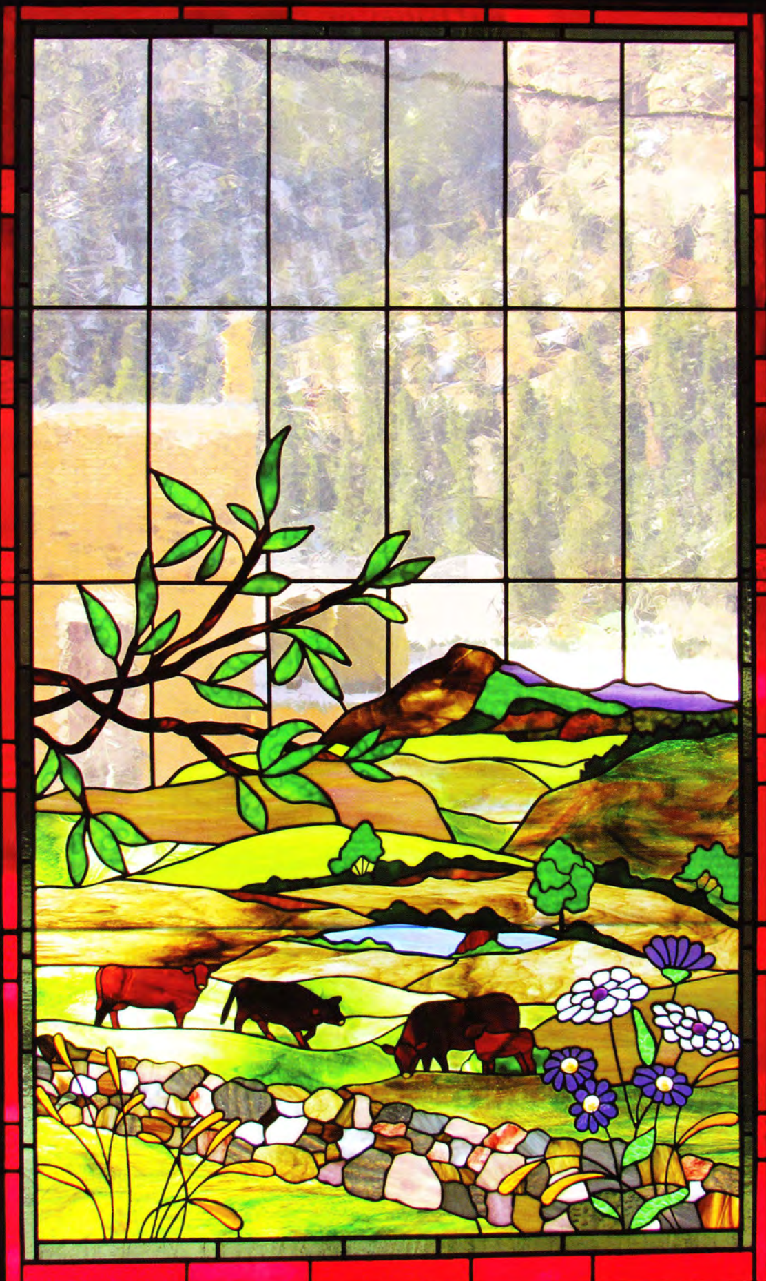
The window shown on the facing page features the minerals of the area. Here, we see flora, fauna, and mountains.